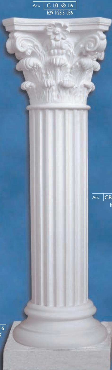
Art. C 10 Ø 16 b29 h25,5 d36