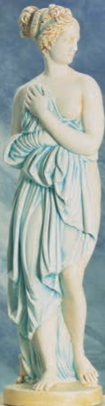
Art. | S 306D