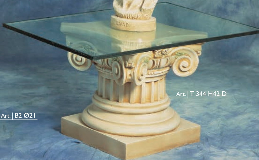
Art. | T 344 H42 D