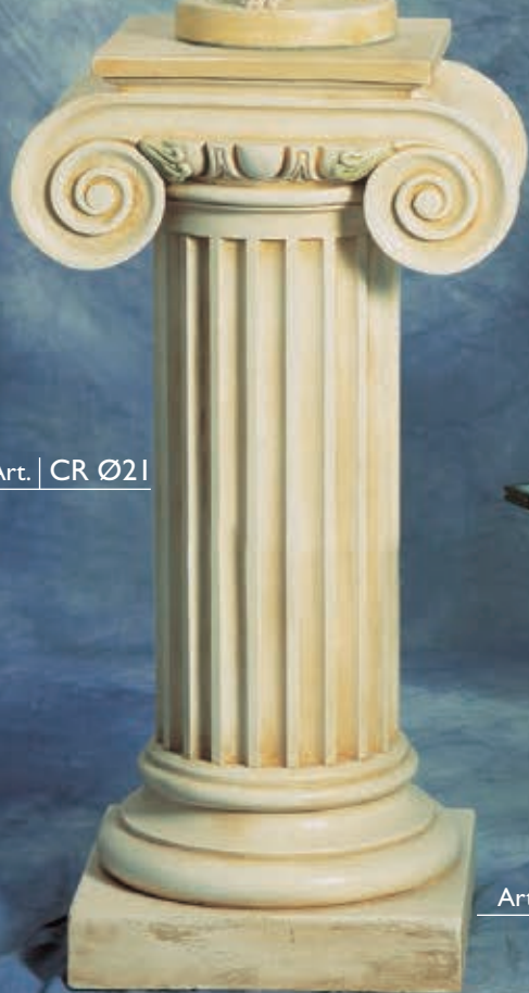
Art. | CR Ø21