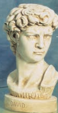
Art. | S 337 D